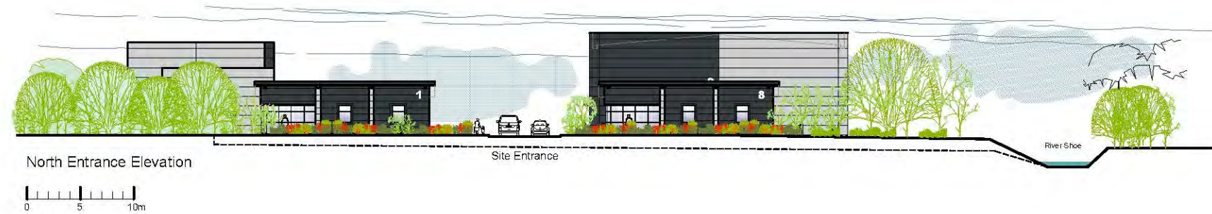
North Entrance Elevation